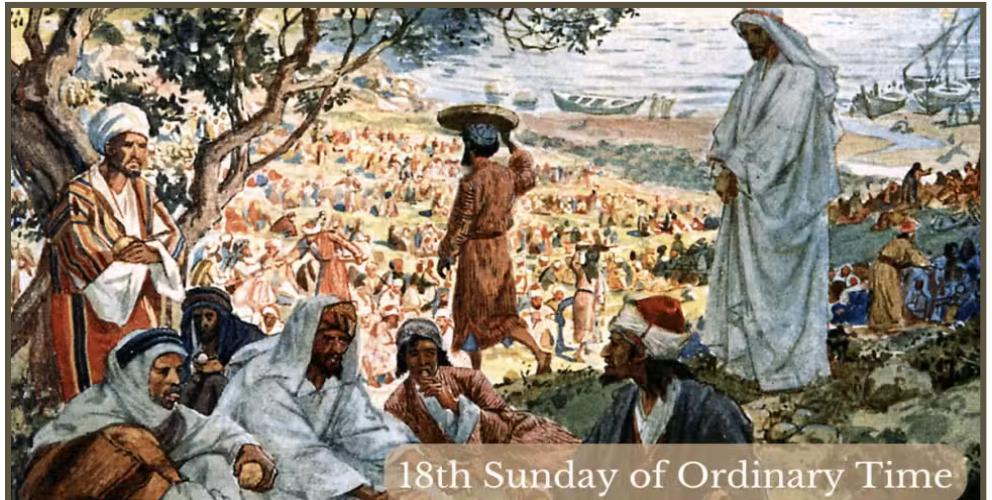
18th Sunday of Ordinary Time

Póngase en contacto con la oficina al menos 9 meses antes